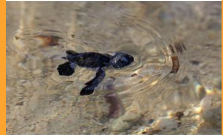
The baby turtles are making it safely to the water!